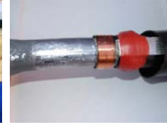
Polywater ® PowerPatch ® PILC Leak Repair