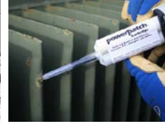
Polywater ® PowerPatch ® Transformer Leak Repair