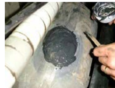
Polywater ® AirRepair ® Pressurized Cable Leak