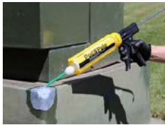
Polywater ® Pad N Pole ™ Utility Enclosure Repair System

Select any product from the display below for more detailed product information.