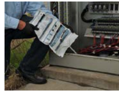
Polywater ® PedFloor ™ Pedestal Sealant Foam Barrier