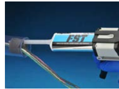
Polywater ® FST ™ MINI Duct Sealant