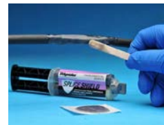
Polywater ® SpliceShield ™ Environmental Barrier