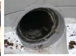
Polywater ® Dura-Plate ™ 100 Epoxy Mortar