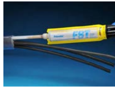
Polywater ® FST ™ Foam Duct Sealant