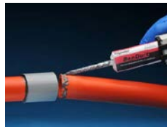
Polywater ® BonDuit ® Conduit Adhesive