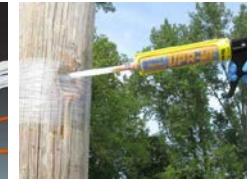
Polywater ® UPR ™ Utility Wood Pole Repair