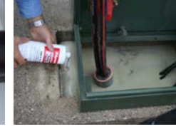
Polywater ® InstaGrout ™ Utility Pad Sealant Barrier