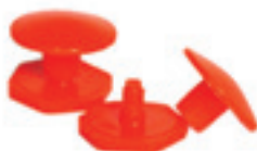
B22 Two-piece sleeve button 4 required per pair of sleeves