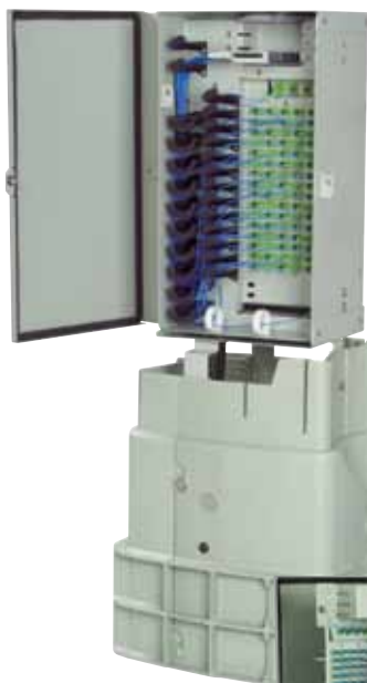
NetSpan™ FDH Compact Series Pro12, 96 Port FDH

The series is available in 72, 96 or 144 port distribution with preterminated SC/APC 100' dielectric loose tube feeder and distribution cable stub as the standard configuration. The NetSpan™ FDH Compact Series is available empty or loaded with (1) 1x32 splitter module.