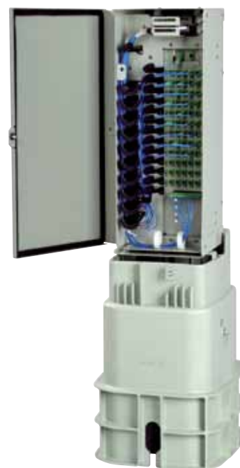
NetSpan™ FDH Compact Series Pro10, 72 Port FDH