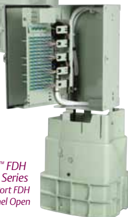
NetSpan™ FDH Compact Series Pro12, 96 Port FDH Internal Panel Open